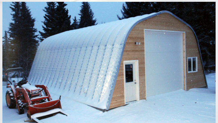
X Model, 30'W X 16'H X 36'L Anchor Point, AK