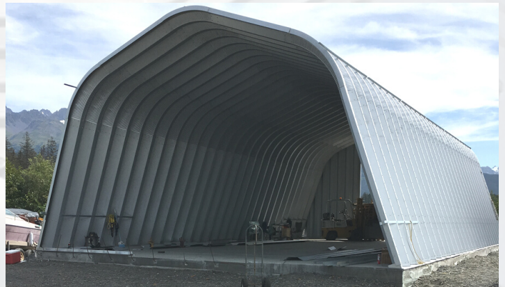
XX Model, 36'W X 20'H X 59'L Anchor Point, AK