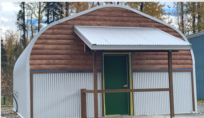
A Model, 20W X 13'H X 26'L Palmer, AK