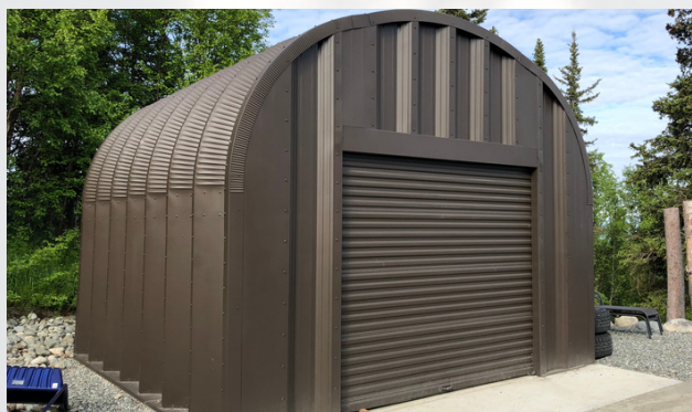
S Model, 14'W X 11'H X 14'L Anchorage, AK