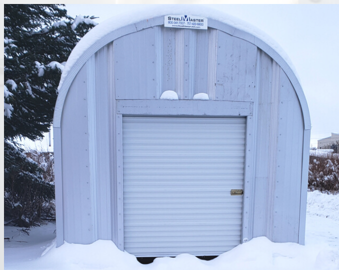
S-Model, 12W X 11'H X 16'L Chignik, AK