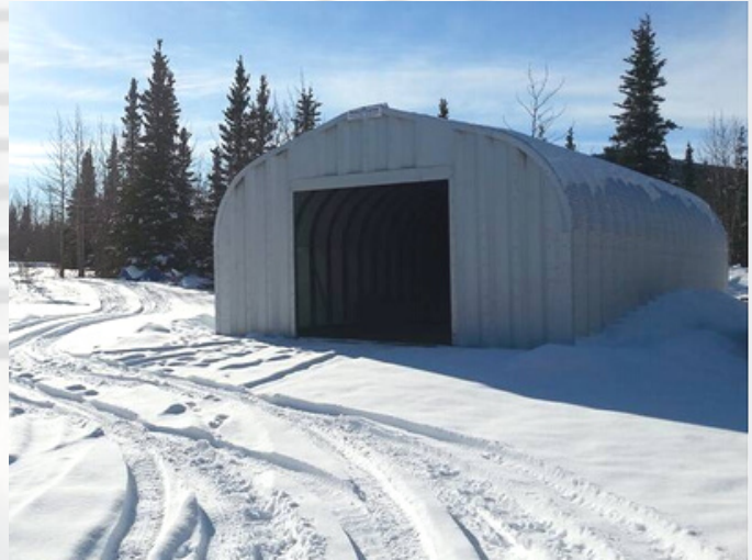
A-Model, 20'W X 12'H X 36'L Healy, AK

Model: 3 buildings Model S12-11, S14-11, A20-12)