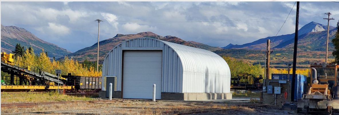
XS Model, 30'W X 18'H X 59'L Healy, AK