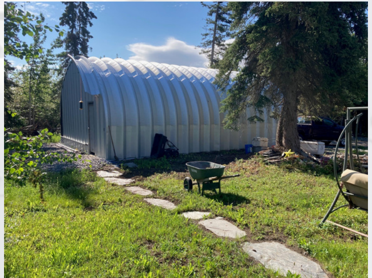
S-Model, 25'W X 15'H X 34'L Kenny Lake, AK