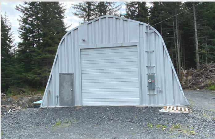
X-Model, 30'W X 19'H X 40'L Port Lions, AK