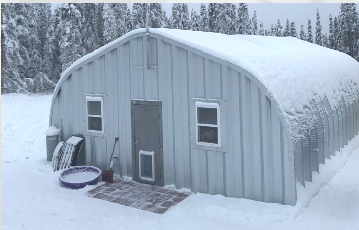
A Model, 25'W X 13'H X 38'L Fairbanks, AK