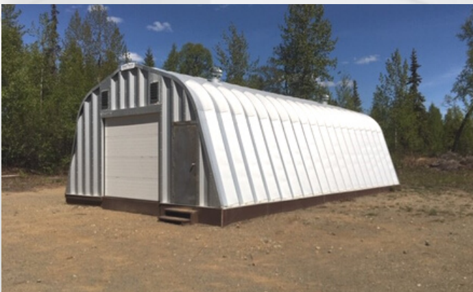
X Model, 23'W X 13'H X 40'L Beluga, AK