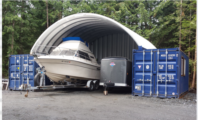
Q-Model, 26'W X 7'H X 20'L Ketchikan, AK