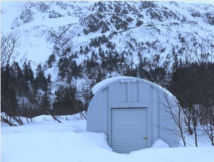
S-Model, 12'W X 11'H X 20'L Whittier, AK