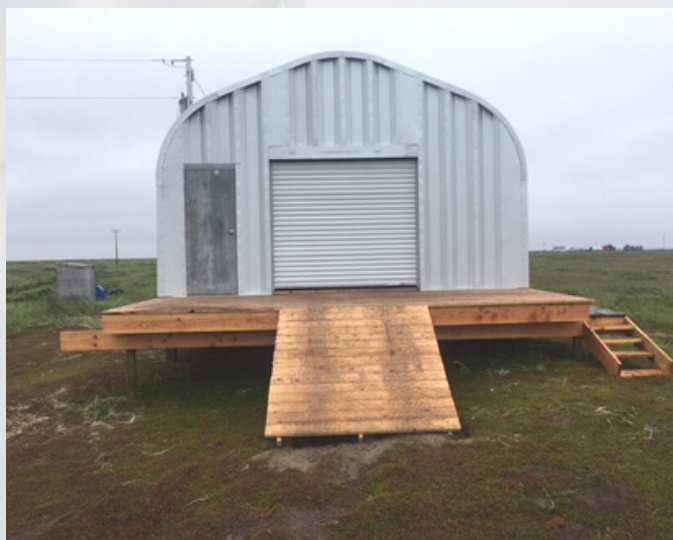
A-Model, 20W X 13'H X 24'L Pilot Point, AK