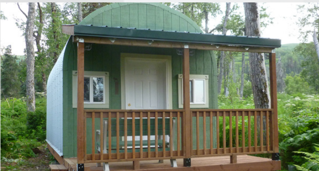
S Model, 12'W X 11'H X 20'L Dillingham, AK