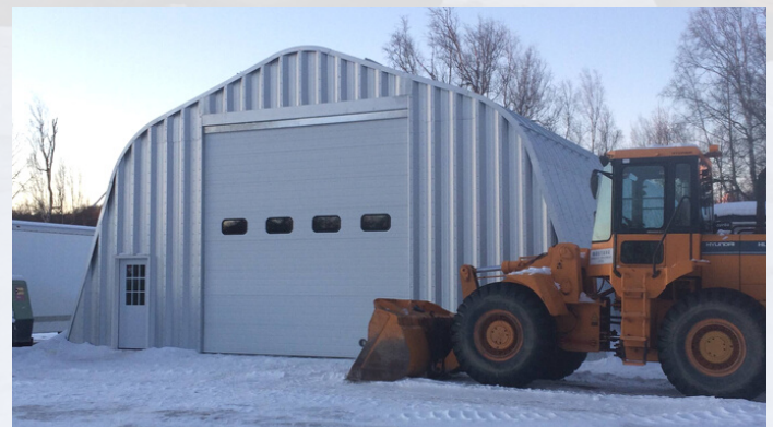
XX Model, 41W X 21'H X 55'L Palmer, AK