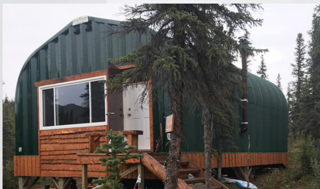
A Model, 20'W X 12'H X 24'L Kotzebue, AK