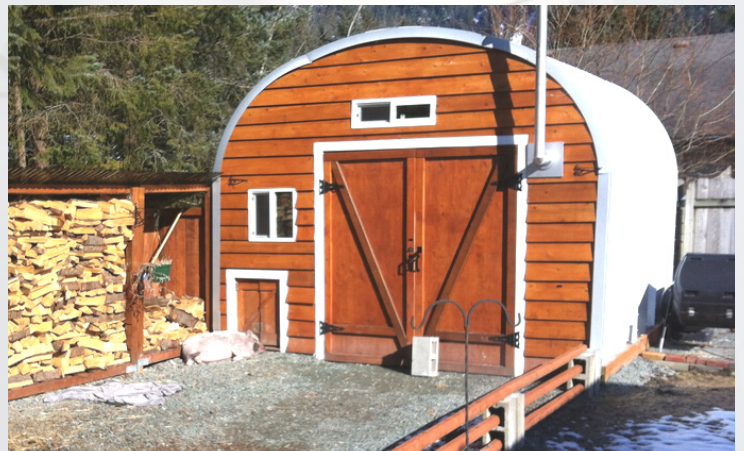
S-Model, 14'W X 11'H X 14'L Juneau, AK