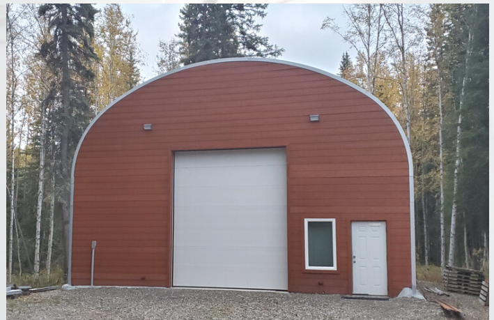
XS Model, 34'W X 24'H X 45'L Salcha, AK