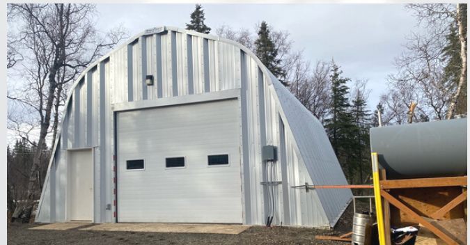
XX Model, 28'W X 17'H X 35'L Dillingham, AK