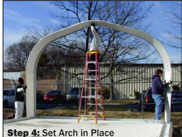
Step 4: Set Arch in Place