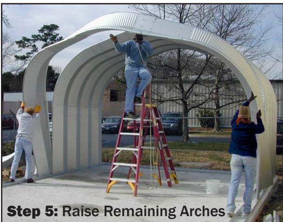
Step 5: Raise Remaining Arches