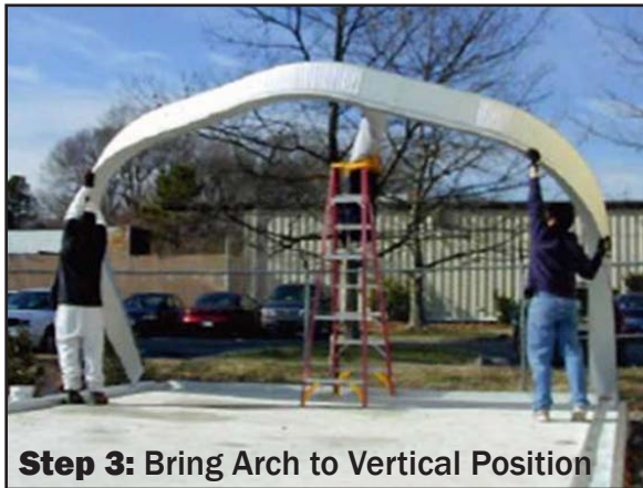
Step 3: Bring Arch to Vertical Position