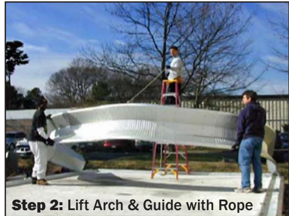
Step 2: Lift Arch & Guide with Rope