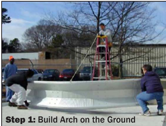
Step 1: Build Arch on the Ground