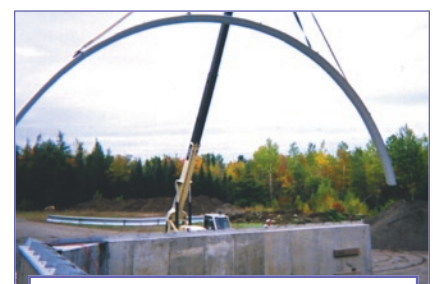
Stand on Base Connector