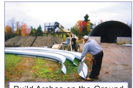
Build Arches on the Ground