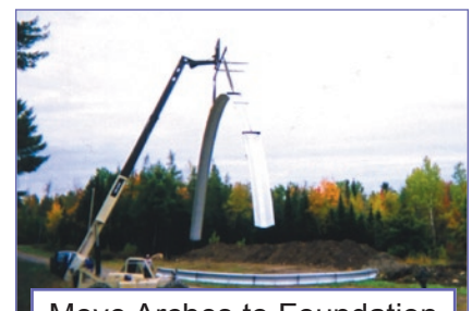
Move Arches to Foundation